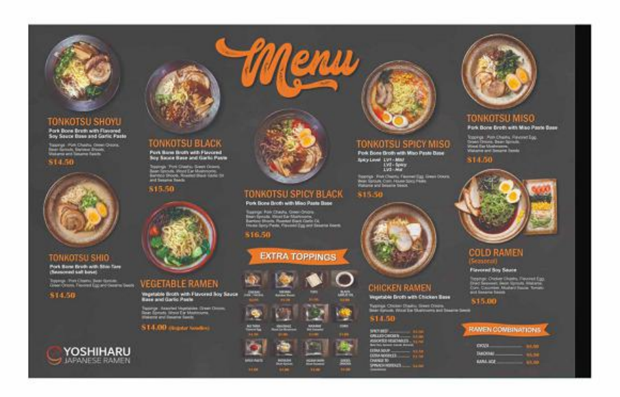
Exhibit J Tenant's Menu